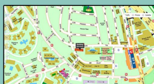
BEAUTY WORLD BRANCH

Venue: 14D Jalan Masjid Kingston, Terrace #01-01 Singapore 418935 LIVE ON ZOOM , FACEBOOK LIVE & YOUTUBE LIVE