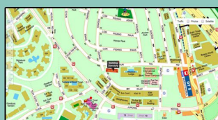
BEAUTY WORLD BRANCH

Venue: 14D Jalan Masjid Kingston, Terrace #01-01 Singapore 418935 LIVE ON ZOOM , FACEBOOK LIVE & YOUTUBE LIVE